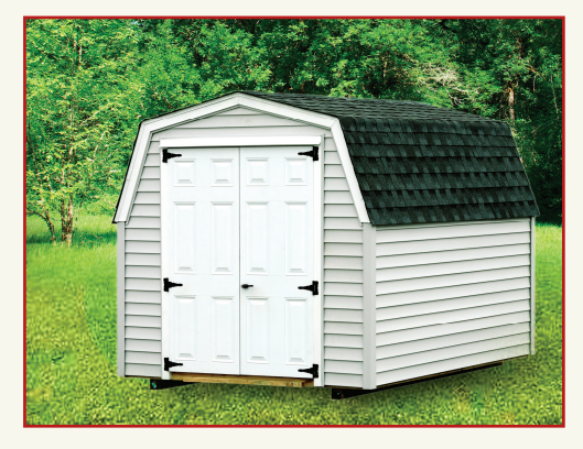
8 x 10 Vinyl Sided Mini

Fiberglass raised panel doors Aluminum coil stock for trim Louvered Shutters