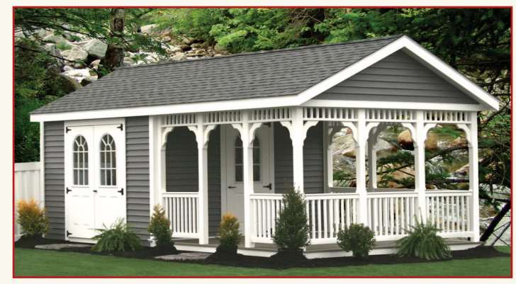
12 x 24 Vinyl Sided Pool House

Versatility is the key to our pool house designs! This model gives you the flexibility of a storage area and a porch area which can also be screened. The storage area can be designed for use as a changing room, outdoor kitchen, tiki bar, game room, or whatever your imagination can conjure up.