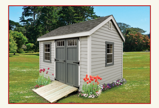
10 x 12 New England 7' Cottage

Added Options: cupola and 9 lite glass in doors. Colors: Pearl, white trim, Belmont blue doors and louvered shutters, Dual grey shingle.