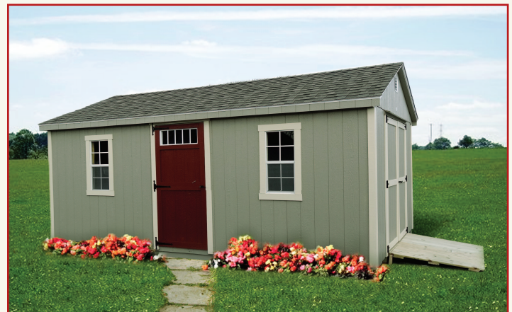
12x20 Cottage with 7' Side Wall Shown with option of an added 36" transom entry door. Colors: Clay, Navajo trim, weatherwood shingle and red transom door.