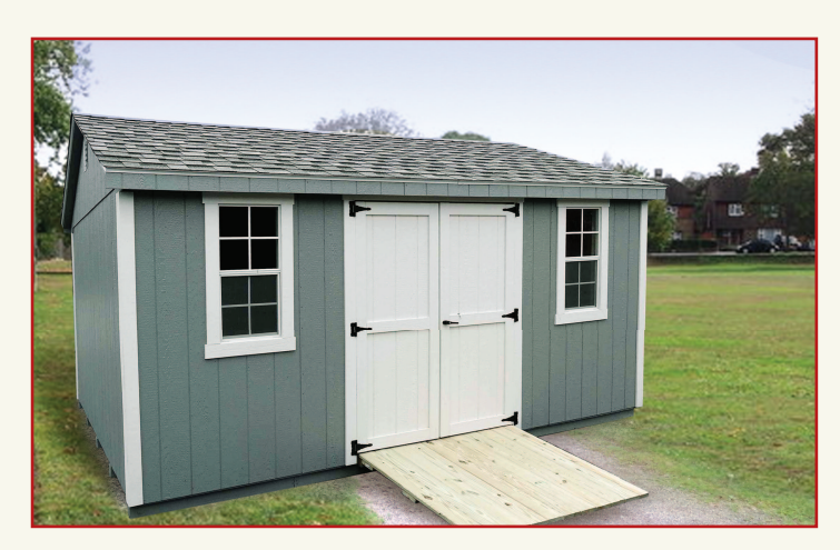
12 x 16 Cottage: Smartside siding. Colors: Glick grey, white trim and doors, dual grey shingle.

Our most popular model, the Cottage looks good and provides great storage space. The gable roof comes with our standard 5/12 pitch or you can upgrade to a 7/12 steep roof. Doors and windows can be placed anywhere on the building you desire, and you can also opt for the 7' side wall which will give you maximum storage space with the smallest foot print. Add in a workbench, loft or shelving to create the best storage solution for your needs.