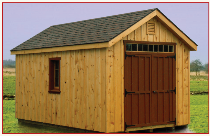
10 x 16 Pine Board & Batten Cottage:

Natural Wood Sided Sheds are certainly beautiful but they do require regular maintenance. We offer Log siding, Pine and Cedar in Board & Batten, Tongue & Grove and Ship Lap styles, as well as Cedar Shake.