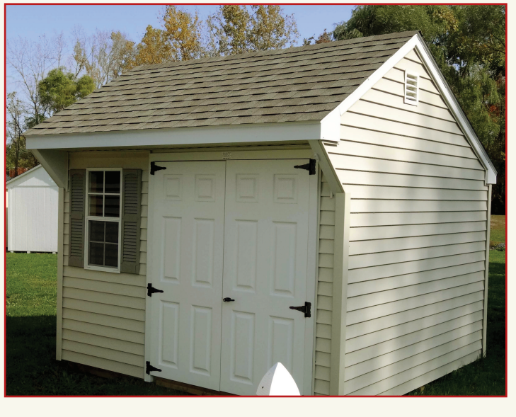
10 x 10 Quaker in 4/4 Vinyl: Colors: Almond, white trim, weatherwood shingle, clay louvered shutter.

With a little more style, the Quaker has a distinct look which is accented by its large front overhang. Doors and windows can be placed on any wall, although traditionally the door is placed on the front wall under the overhand.