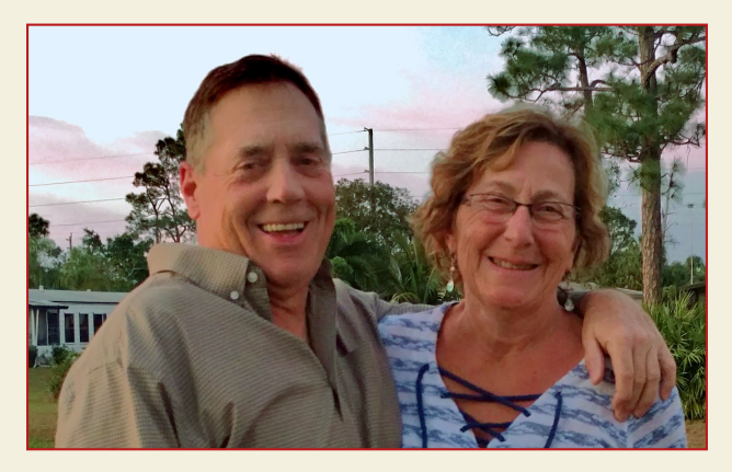
Backyard Sheds is a family owned and operated business that provides our customers over 20 years of experience in the manufactured shed industry.

All our products are handcrafted by the Lancaster Amish Community. Our builders have been with us for no less than 15 years and they are our trusted friends as well as business partners.