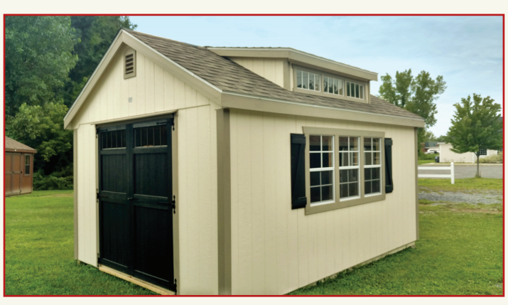
10 x 16 New England Shed Row Dormer Cottage

Added options: 11 Lite glass in doors, two 24x36" windows with shutters, octagon window in gable dormer. Colors: Blue vinyl, white trim, black shingles & louvered shutters.