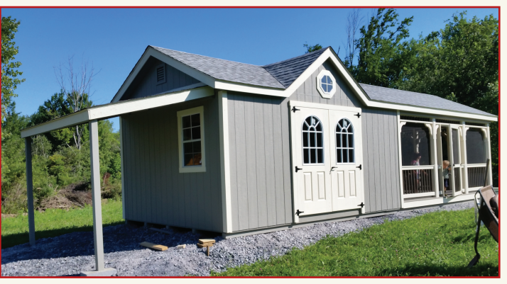
12 x 28 SmartSide Dormer Pool House with optional hinged lean-to.

Shown with standard features and no screens on porch. Standard features on a SmartSide pool house is a pressure The vinyl pool house has a vinyl porch, composite decking, 11 or 9 lite glass in double & single doors, two 24x36" windows with shutters, P.T. ramp. Additional options could be an electric package, screened porch. Colors: Slate (special order upgrade), white trim and porch, grey deck, pewter shingle.