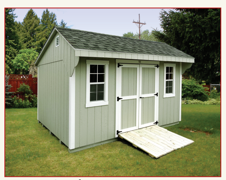
10 x 14 Quaker: Colors: Olive and white with black shingles.

Fiberglass raised panel doors • Aluminum coil stock for trim • Shutters-Louvered or raised panel