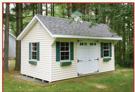
10 x 18 New England Quaker in Vinyl

Colors: Dove grey, white trim, charcoal grey shingles