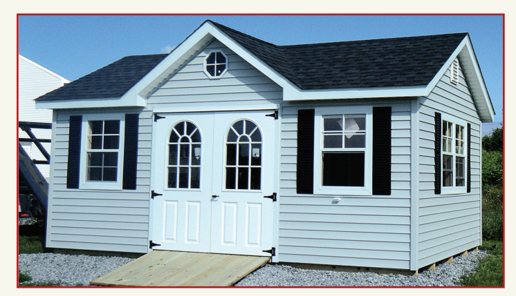
12 x 18 New England 7' Dormer Cottage

Any Cottage shed can have a Dormer added to enhance its appearance and functionality. Dormers provide more natural light, increase interior space and enhance styling helping you match your shed to your homes existing roof line.