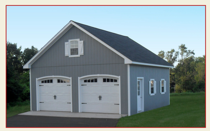
24' x 26' Garage with second floor storage, 8/12 roof pitch, two 9' x 7'6" carriage garage doors with curved trim.