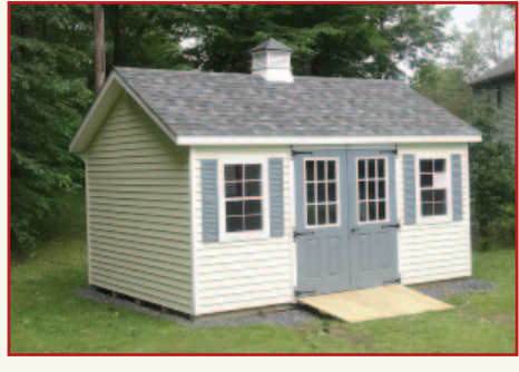
10 x 16 New England Cottage

Colors: Dove grey, white trim, Dual grey shingles, dark grey raised panel shutters.