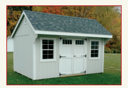
10 x 14 New England Quaker