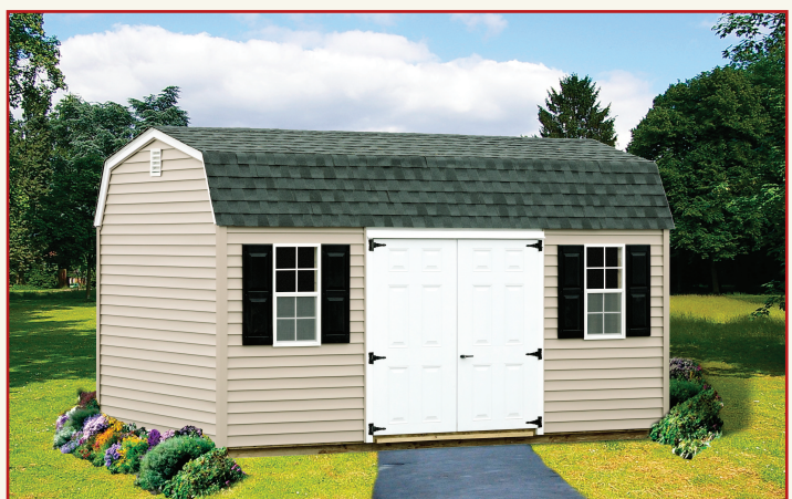
10 x 16 Tall Barn in Vinyl: Colors: clay, white trim with black shingles and black raised panel shutters.