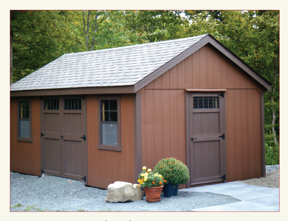
12 x 18 New England 7' Cottage: Shown with additional option of 36" single transom entry door with drip guard. Colors: Chestnut, dark brown trim, weatherwood shingles, brown windows.