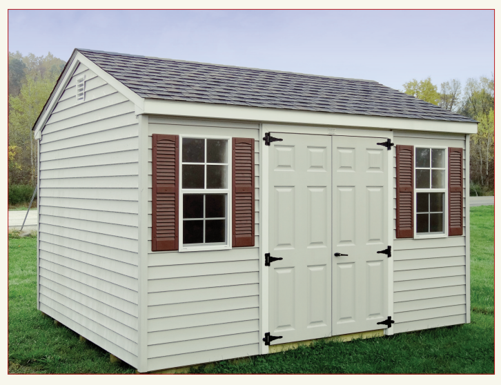
10 x 12 Vinyl Cottage: Colors: Dove grey, white trim, black shingles and red louvered shutters.

Fiberglass raised panel doors • Aluminum coil stock for trim • Shutters-Louvered or raised panel