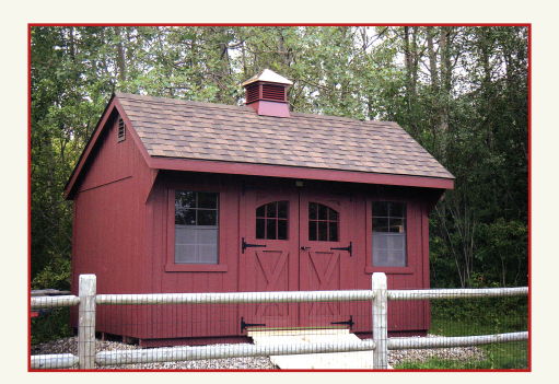
10 x 16 New England Quaker

Added Options: Extra window, window boxes and cupola. Colors: Cream, white trim, dark green louvered shutters and boxes, black shingle.