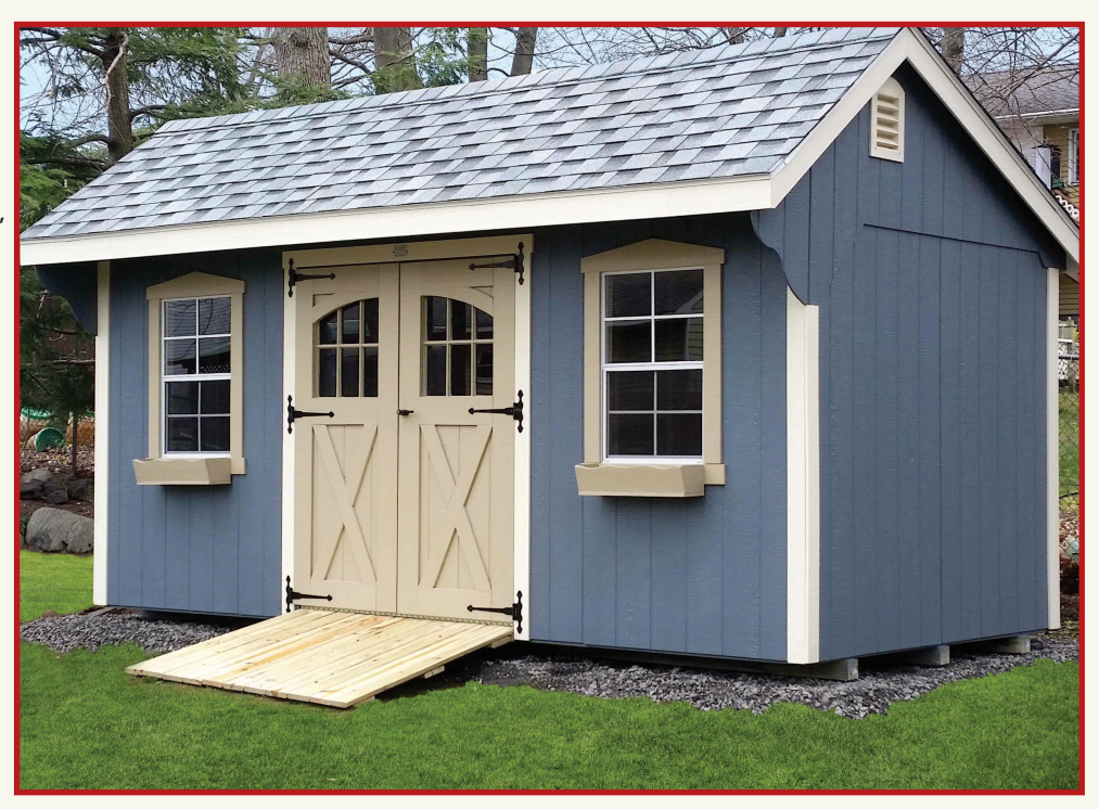
8 x 16 New England Quaker: Added Options: Carriage doors, window boxes. Colors: Custom blue, white trim, tan doors, Dual grey shingle.