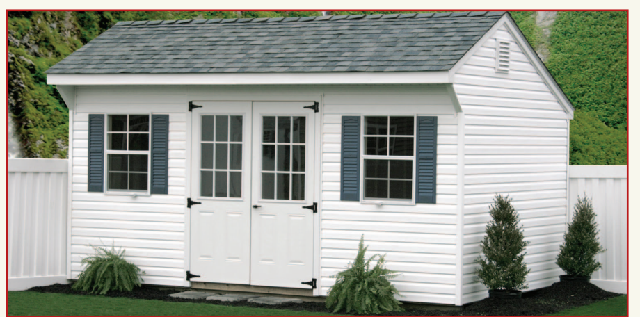
10 x 18 Quaker in Dutch Lap Vinyl: Added option of 9 lite glass in doors and larger 24" x 36" windows. Colors: White with charcoal grey shingle and blue louvered shutters.