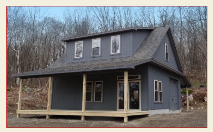
26' x 28' Custom Woodland Cabin on Grafton Lake.

SmartSide siding with front porch and a car port in the rear. Open concept down stairs, three bedrooms up.