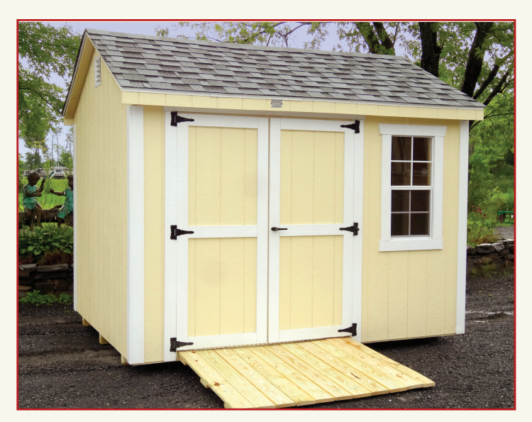
8 x 10 Cottage : Colors : Creme, white with dual grey shingles

Our most popular model, the Cottage looks good and provides great storage space. The gable roof comes with our standard 5/12 pitch or you can upgrade to a 7/12 steep roof. Doors and windows can be placed anywhere on the building you desire, and you can also opt for the 7' side wall which will give you maximum storage space with the smallest foot print. Add in a workbench, loft or shelving to create the best storage solution for your needs.