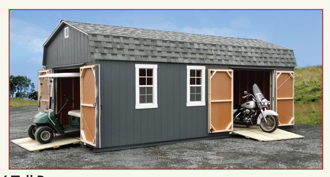
12 x 24 Tall Barn: Shown with option of extra set of double doors and second ramp. Colors: Dark grey, white with dual grey shingles.

Standard Tall Barns have a Gambrel roof, which means a lot of interior room. Side wall height is 6' and in combination with the barn style roof this barn has the most overhead room of all. It lends itself to a loft application to increase your storage space. Not everyone is a fan of the look but if you're into storage space, this is the choice.