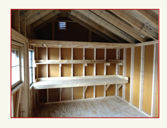
Work bench and loft option

With a little more style, the Quaker has a distinct look which is accented by its large front overhang. Doors and windows can be placed on any wall, although traditionally the door is placed on the front wall under the overhand.