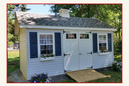
10 x 16 7' New England Cottage in Vinyl

Built with enhanced trim package and a classic transom window in the door, the New England Series will add the finishing touch to your landscaping plans, while providing that extra storage space we all need. The New England Series can also be easily converted into a finished office space, craft room, workshop, potting shed or just a needed get away spot. These models provide the room you need in style.